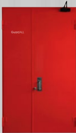
SINGLE DOOR + DOOR CLOSER

AVAILABLE for differents kind of size, colour and accessories