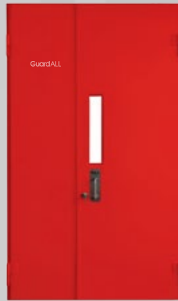
SINGLE DOOR WITH GLASS WALL